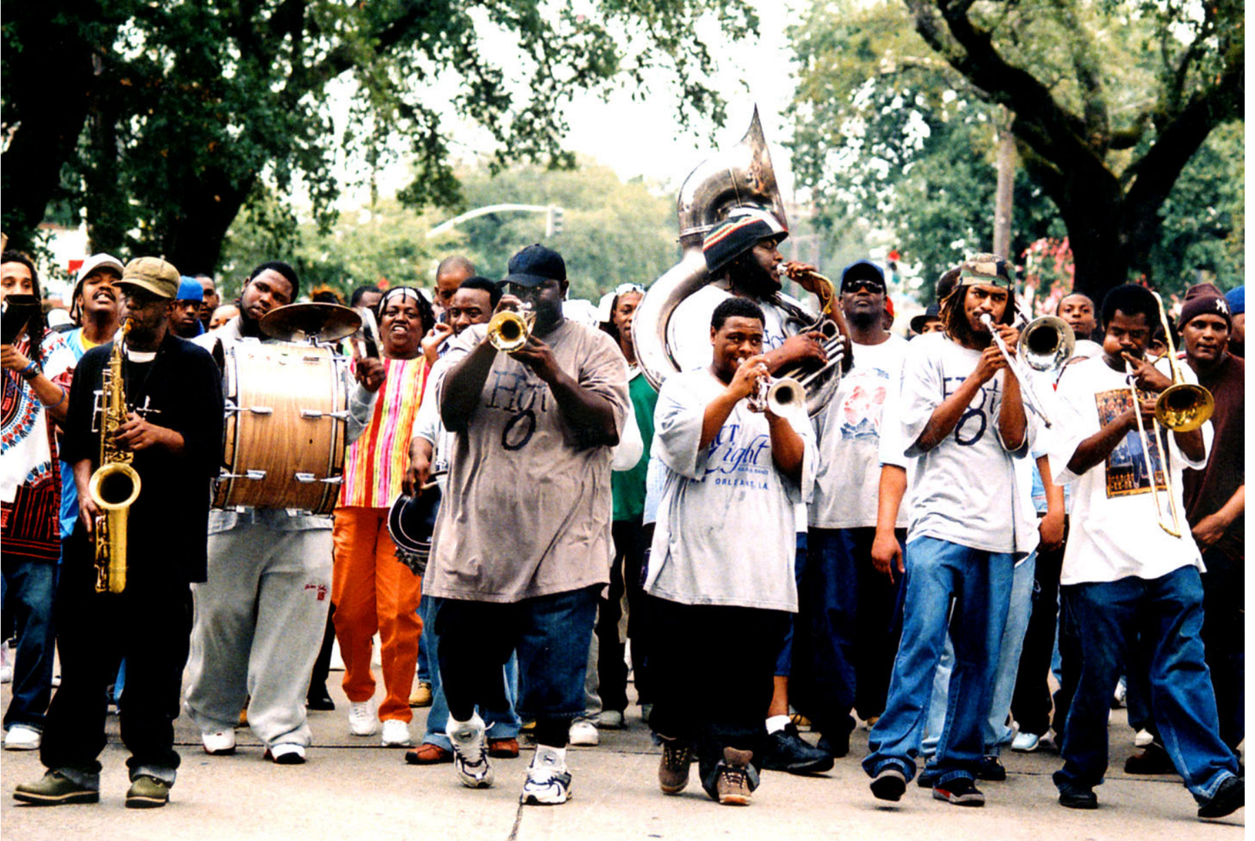
(BIG) EASY DOES IT Hot 8 on a “second line” in New Orleans

that with last year’s Tombstone , which lyrically honoured their fallen comrades and garnered serious acclaim. This month, their “Sexual Healing” cover prominently features in Chef , Jon Favreau’s terrific film about a burgeoning food truck business.